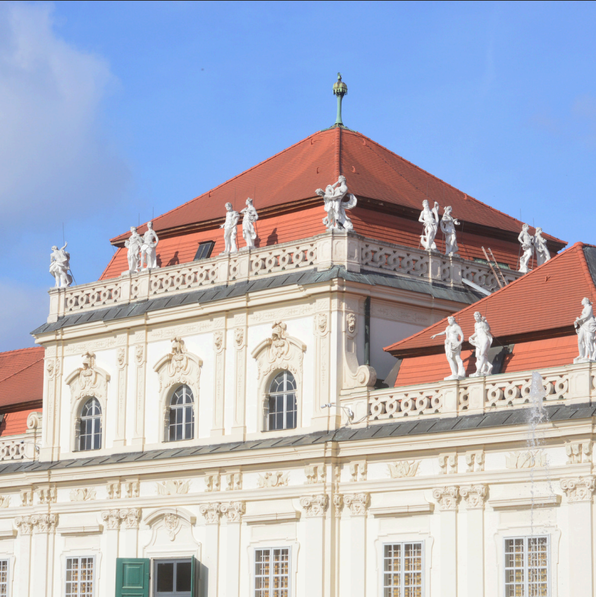
Building in Vienna