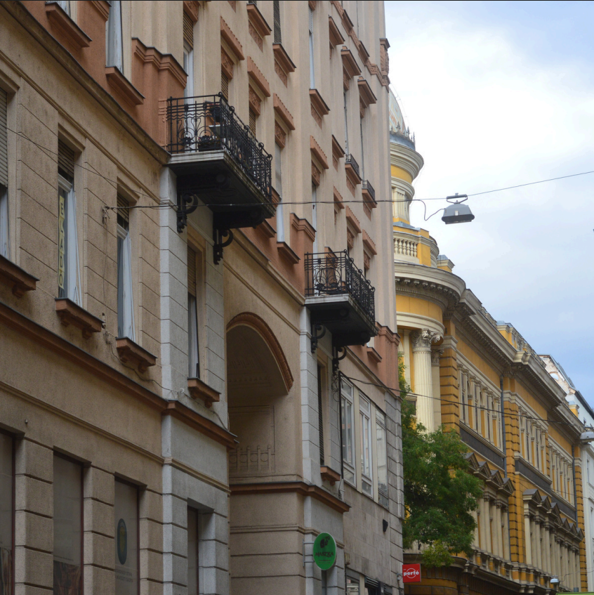
Streets in Denmark